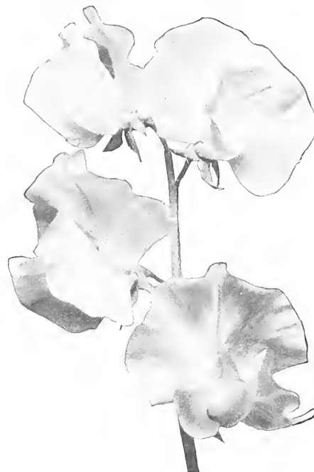
MORSE'S GIANT ROSE 1-3 Natural Size